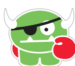
TARTAR THE TERRIBLE