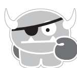
TARTAR THE TERRIBLE